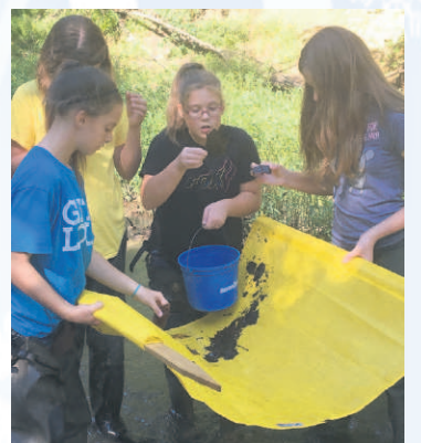
Students sift through contents of the stream bottom!