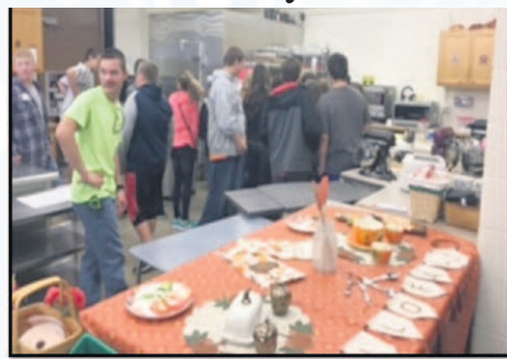
This is HOSPITALITY-! Eighth Grade Students try their hands at food preparation! Knowing all about the best ways to prepare food isn't just for adults! The students assisted in baking bread. Preparing recipes for pleasure brings students back to the table for more! This cake looks delicious, too. There are careers for chefs!